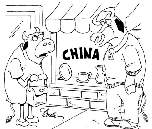
"Maybe it would be best if you waited out here."

The CDC urges Americans to get their flu shots by the end of October. If you have questions about the flu or other type of vaccines, you should contact your healthcare provider.