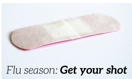
Flu season: Get your shot